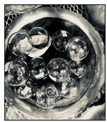
Small floats at Finders

Here in the Pacific Northwest we are the accidental recipients of a gift from the sea, glass floats. These wonderful collectibles may have been at sea for well over ten years before they washed ashore on our beaches. Ocean currents create a great big circle and the floats from fishing nets that are long gone bob and float and drift in this pattern until a big storm breaks the circle for a few days and some of them head for shore with the weather. Most fishing floats lost in the Pacific land up in Oregon, Washington, and Alaska and after major storms lucky finders just might come upon one on a sandy beach.