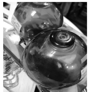
Uncommon Brown Floats

Floats range in size from golf ball to soccer ball size and the colors range from aquamarines and greens to browns and more rarely, yellows. Floats that are bright reds or blues or vivid yellows are in most cases floats made as curios and not actually fishing floats. They are thinner and more polished looking than real working floats, where all that mattered was could they float and do their job? They are usually sealed with a blob called a button and if they are marked that's normally where you will find the mark.