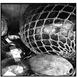
Floats come in many sizes

Who knew? Fishing floats are a great recycled collectible artifact. They were made in places all over the world, but best known to us are the Japanese floats